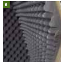
5- DRI-SYSTEM NOISE INSULATION CASING permits ease of access to all components