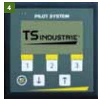
4 - PILOT SYSTEM Combined machine control and monitoring

New design: 4 rows, 12 hammers with replaceable heads and 6 cutting blades