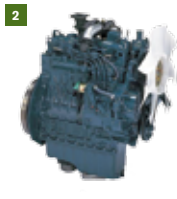
2 - KUBOTA V1505 T 45 CV/ 33,57 kW 4-cyl diesel engine, water-cooled