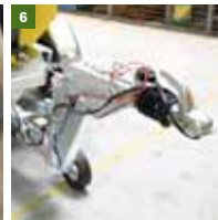
6- PARALLELOGRAM DRAWBAR BRAKED